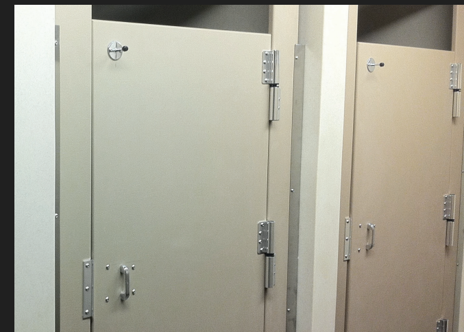
Image shows Mystera Fawn MSB-982 shower dressing rooms in a university dormitory.

Mystera vertical wall panels are the perfect solution for University housing, multi-family complexes, or Hospital rooms. Mystera ¾" solid surface panels create a clean and durable surface.