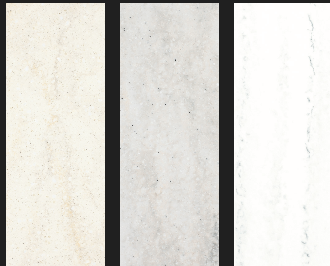
Chardonnay MSB-921 Cirrus MSB-922 Cararra MSB-927

With subtle, linear veined designs in white, cream and gray tones, this color collection adds distinct direction and visual appeal to any design. Selected specifically to support both commercial and residential design pallets. Let the variation in these colors provide contrast to your creation.