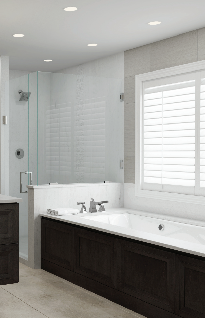
Image above shows a complete custom bathroom design utilizing Mystera Carrara MSB-927, including shower walls, vanity top, tub and deck, and cosmetics vanity. Matching vanity material coordinating colors with shower panels.