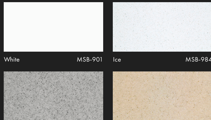
White MSB-901 Ice MSB-984 Storm MSB-983 Fawn MSB-982

From solid white to a particulate mist color with semi-translucent chips, these colors are appropriate for all commercial applications, and can also be used in residential applications. The simplicity of the design will fit the budget of most any project.